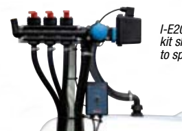
I-E2012 control kit shown fitted to sprayer.

If you need an electric control system for your sprayer, take a look at the manifold options listed below to hook up to an auto-rate controller.