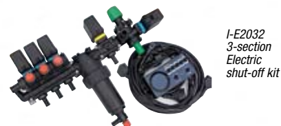
I-E2032 3-section Electric shut-off kit