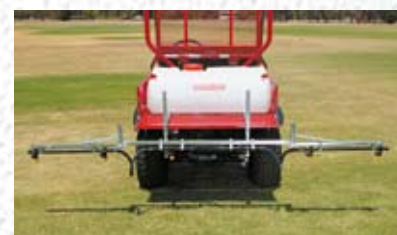
3 Metre Blockmaster Boom shown mounted on a 4-wheel ATV