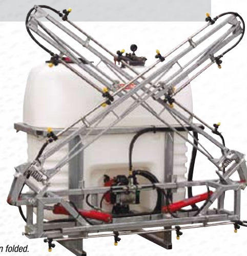
GEX Boom shown folded.