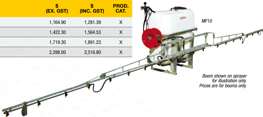
Boom shown on sprayer for illustration only. Prices are for booms only.